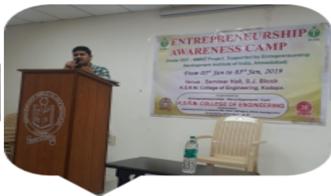
Resource persons creating awareness in the minds of the students