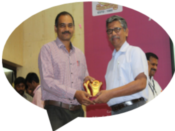
Director congratulating the staff with mementos