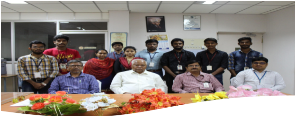
Selected Students with college officials