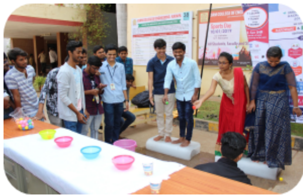
Teachers busy in participating the events