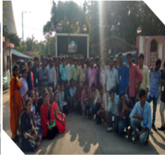
Students and staff taken a snap at Rayalaseema Thermal Power Plant (RTPP)