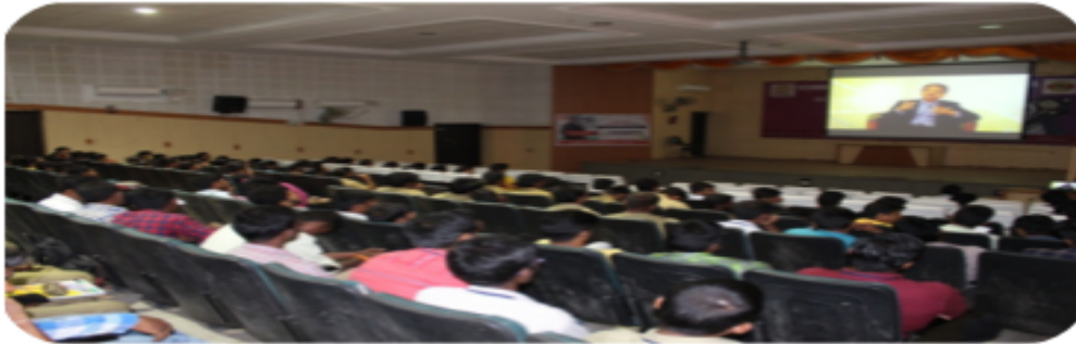
Fig. 1. Live telecast of the program in the KOR Auditorium, KSRMCE.

Ministry of Human Resources and Development (MHRD) organized first Leadership Talk Series, which was live telecasted by Sri Anand Mahindra, CEO, Mahindra Group, on 8th January, 2019. from 2.00 PM to 3.00 PM. This television broadcast was arranged at K.O.R Auditorium. Nearly 250 students and 25 faculty members of the college were present.