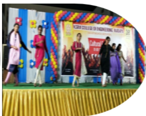
Dance performance of the students at cultural fest