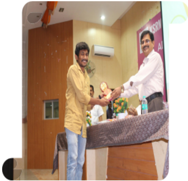
Principal appreciating the student with