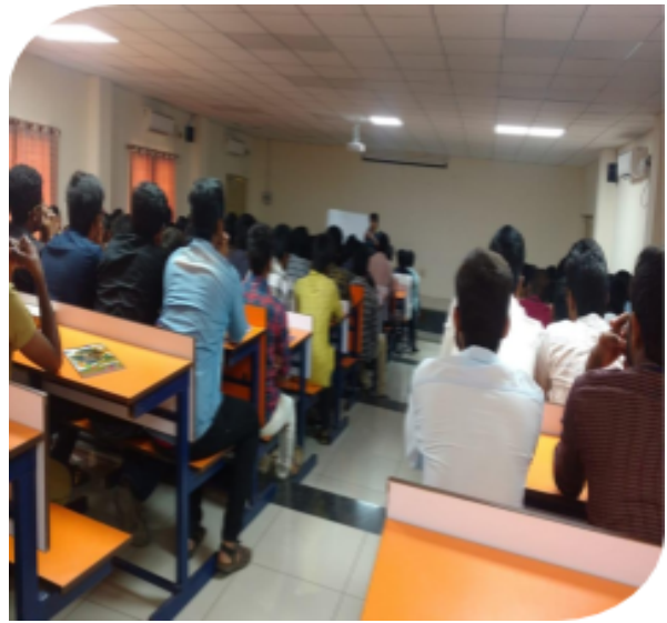
Chief guest addressing the students on GATE Exam