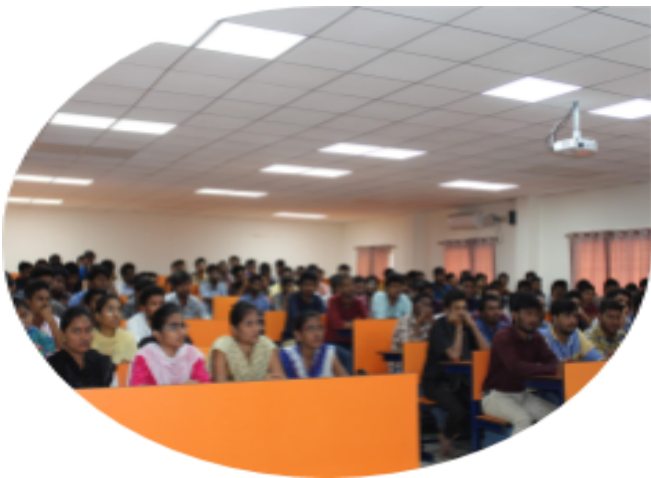
Students attended the awareness camp