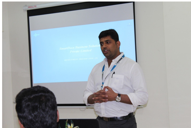
H.R guiding the students on