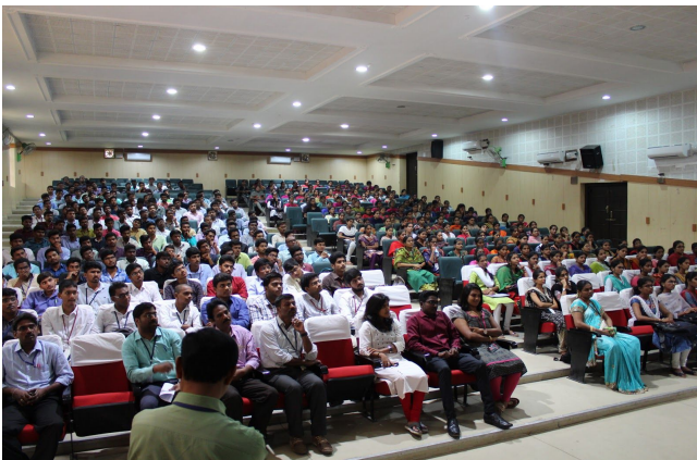
Students attended the placement drive placements